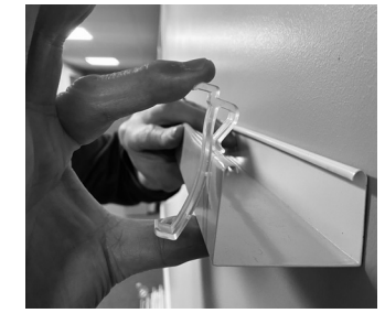
Hook the valance shaped clip onto the front edge of the headrail allowing 5cm clearance between control mechanisms and valance clips.