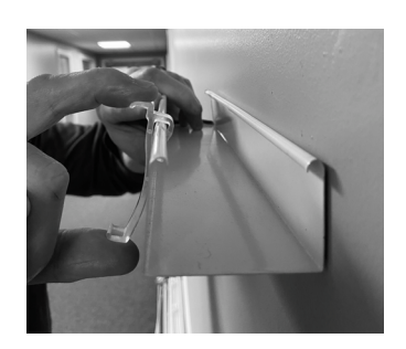
Clip the valance clips on to the front edge of the headrail as shown in image above.